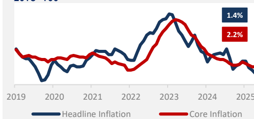
PH Inflation Rate (in %) 2018=100